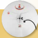
18-inch Monoloop (P/N 3011-0075)

Find more gold of all sizes and at all depths with a specialist Commander accessory coil.